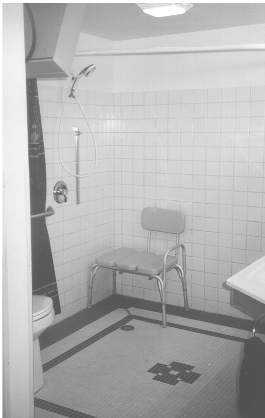
A bathroom which is accessible for all is a major feature at Sunset Pines Resort, as is the rest of the cottage, from the hardwood floors to very wide door ways to accommodate wheel chairs.

The future holds more ideas for Dale. As Sunset Pines Resort grows Dale has more cabins in mind to accommodate more disabled and able vacationers in the Willard Area. To find out more on Sunset Pines Resort Contact Dale Petkovsek at W9210 Rock Creek Rd., Willard, WI 54493, 715 267-6889 or you can view and get great information on the web at www.sunsetpinesresort.com .